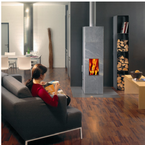
GEO wood-burning fireplace

The GEO, for example, is extremely well-suited for MINERGIE® buildings. Not only was GEO repeatedly awarded for its simple design, but it also provides convincing results with its 350 kg soapstone thermal storage capacity that supplies heat for over 15 hours.