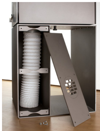
Intake through the floor

The air intake can be concealed by installing it through the floor or can be installed through the rear wall. The connection height is at the 120 mm mark, starting from the floor and measuring up to the middle of the pipe (this does not apply to Pilar 175 mm and Taiko 78 mm). The pipe diameter is 100 mm for lengths of maximum 4 meters with two 90° angles.