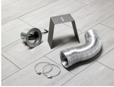
Installations set contents